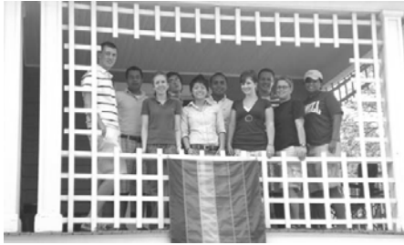
Six Student Staff

Syracuse University - Division of Student Affairs