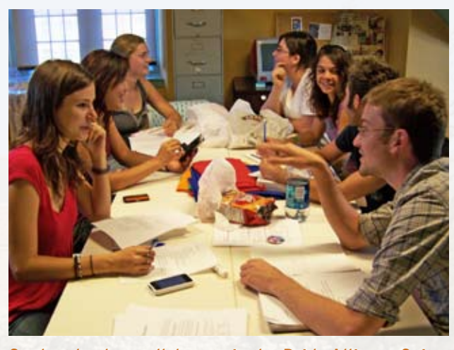
Student leaders collaborate in the Pride Alliance Suite.

http://www.washujsu.com jsu@sugroups.wustl.edu